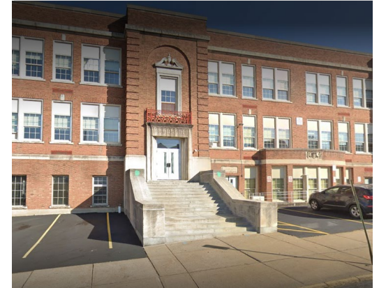
Wilkes-Barre Area Career and Technical Center Career Exploration Center @ Dodson

All Career and Exploratory students will receive Industry recognized certifications including: