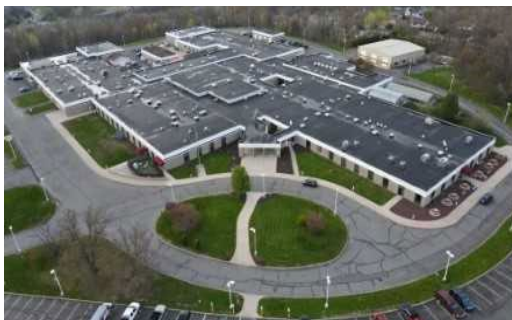
Wilkes-Barre Area Career and Technical Center / 350 Jumper Road WB, PA 18705